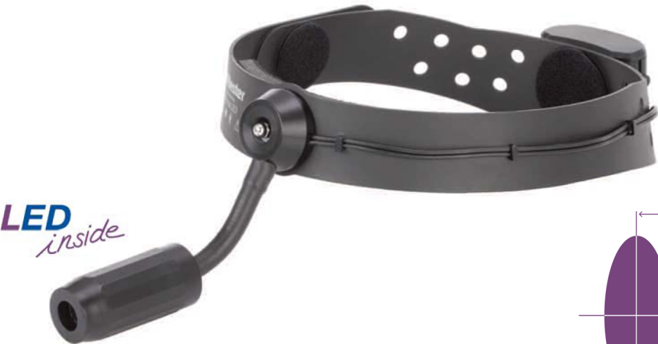
Infinitely adjustable examination area size.