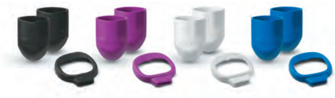
Welch Allyn Pocket LED Handle Bumpers and Otoscope Window Bumpers

Customise with our accessory kit* to mix and match your look.